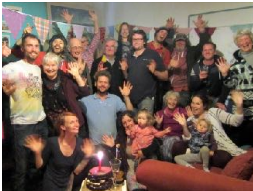
Trelay Cohousing celebrating their successful award of £12,000 from Marks and Spencer Community Energy Fund for its Sunshine Batteries project